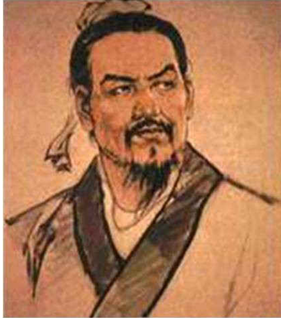
Figure 5. Portrait of Han Fei (280-233 B.C.E.)

Lao Tzu, like Confucius and Mencius, minimized the importance of rewards and punishments. Instead of rewards and punishments, Lao Tzu argued that people are to follow “the Tao” or “the Way.” He did not engage in extremes of large rewards or harsh punishments, he dismissed controlling others using fear tactics, and he generally promoted a rehabilitative and “hands-off” punishment style. He believed that there is no need to punish because the workings of the universe, or “the Tao,” will naturally create order and stability. A peaceful and harmonious society will arise naturally, Lao Tzu contended, without the need for governmental interference; thus, the role of government is to be minimized. Lao Tzu (2013) writes of punishment: