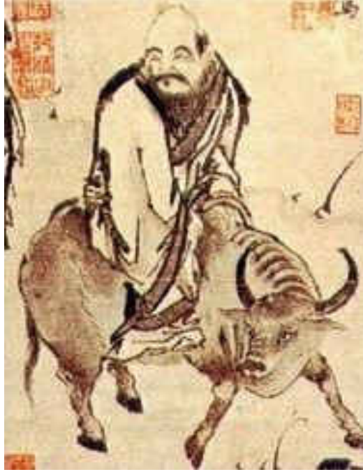
Figure 6. Laozi

Lao Tzu, like Confucius and Mencius, generally rejected a punishment based system of rule, but for different reasons. He rejected the Confucian belief that the public emulated the ruler to any great extent. Although a behavioral connection between ruler and subject is alluded to in the Tao Te Ching , it is a brief and somewhat vague comment, and pales in comparison to the more concrete statements made in the Taoist text that downplay the importance of the relationship between ruler and subject. For the sake of comprehensiveness, the comment connecting ruler and subject in emulation is, “When a ruler lacks faith, so will the people” (Lao Tzu, 2013, p. 17). Instead of ruler intervention, Lao Tzu believed that a deviant will naturally revert to the correct path. As water finds an even plain, he argued, people also possess a moral equilibrium in which they continuously revert. People might stray from the path of virtuousness, but their inherent nature will pull them back to the correct path, back to “the Way.” Lao Tzu (2013) writes of this natural correction or reversion after deviance, “Peace is meant to be our natural state. A whirlwind