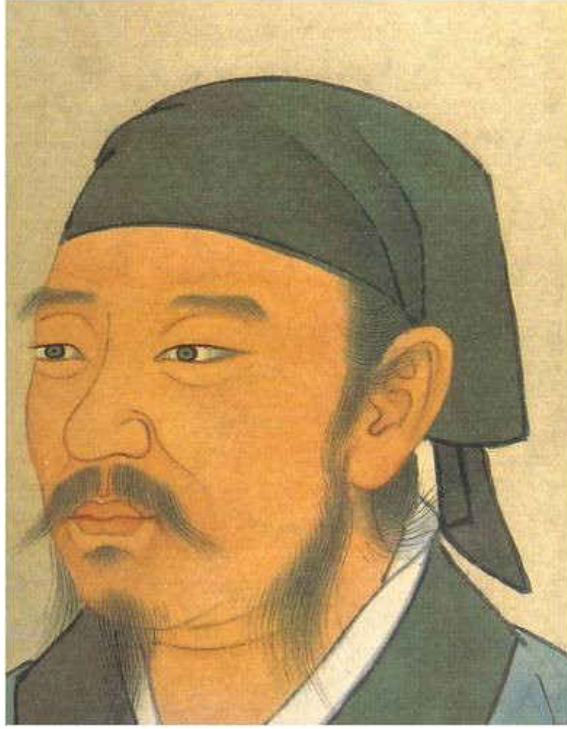
Figure 4. Portrait of Xunzi (300-230 B.C.E.).