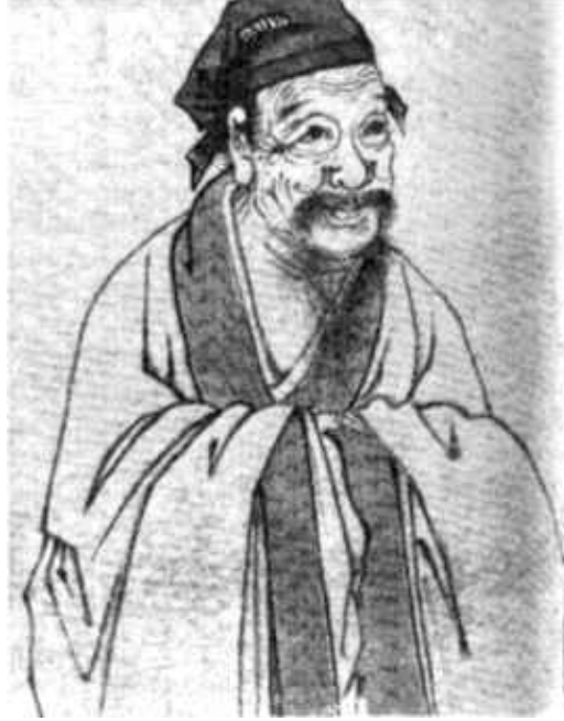
Figure 2. Notable Confucian commentator Zhu Xi (1130-1200 C.E.)

Classical texts, such as those that were examined for this dissertation, are often not easy to understand or interpret in modern times, thus, scholars will often provide interlinear commentary to aid the reader. From the 10 th century to the early 20 th century (which is considered the height of Confucian influence and popularity in Chinese society) it was standard procedure for the Confucian texts to contain interlinear commentary to better explain the original material. A good representative of this interlinear commentary is an eminent Neo-Confucian scholar by the name of Zhu Xi (1130-1200 C.E.). Confucian texts often contain important interlinear commentary written by a scholar like Zhu Xi. Zhu Xi is likely the most well-known and well-regarded Confucian commentator, and his commentary (and commentary like his) was frequently sought throughout this dissertation for clarification and explanatory purposes. Notable Confucian scholar and translator James Legge explains the influence of Zhu Xi on Confucian scholarship: