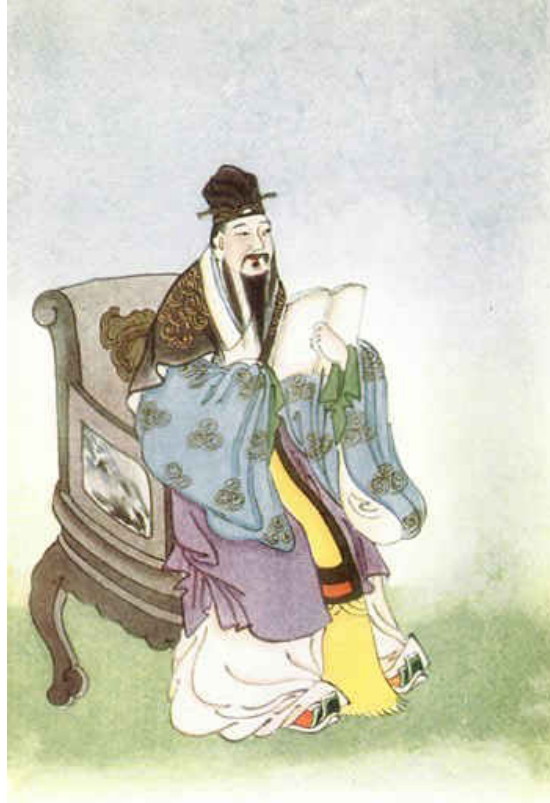
Figure 3. Mencius (372-289 B.C.E.)

Where Confucius developed the skeleton for the Confucian tradition, Mencius (372-289 B.C.E.) added muscle to the bone. Mencius and Confucius make up the twin pillars of Confucianism. The work of Confucius came first, which is a collection of the essential elements of the general theories with a relatively limited range of application and thoroughness, and then Mencius came along approximately one-hundred years after Confucius and greatly expanded upon Confucius' material by providing rich theoretical substance to his concepts and theory. Mencius delved deeper into Confucius' theories, expanded on them, and incorporated many of his own into this philosophical tradition.