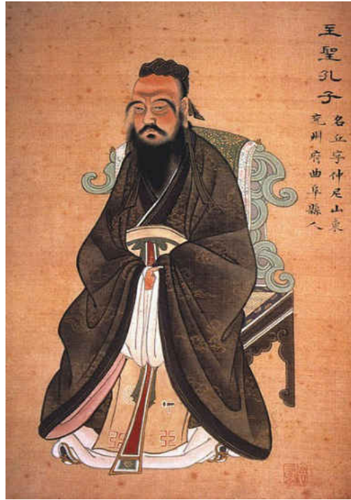
Figure 1. Confucius (551-479 B.C.E.).

Confucius (551-479 B.C.E.) and his disciples were purportedly living in a time of social decline and regional instability. He lived during the late Spring and Autumn Period (770-481 B.C.E.), an age in which moral behavior, personal ethics, and appreciation for the arts was in deterioration throughout the Zhou empire. It was within this social context that Confucius sought individual and societal direction from the sages and sage kings who lived hundreds of years prior to Confucius, in what Confucius thought to be more peaceful and harmonious times. 17 It's important to note again that it is believed that for a significant